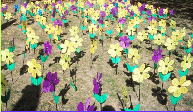
Flowers printed with the reasons why the walkers participate.