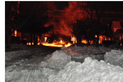
Piles of snow left after shoveling out cars and downtown Fort Madison.