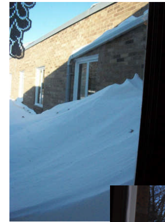
Views from the Director of Nursing's office as the sidewalk is cleared.