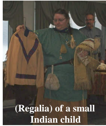
(Regalia) of a small Indian child

blond bear fur, mink, buffalo pelts and more.